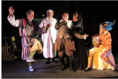
The Trinity Players perform Twelfth Night

Holy Trinity Church in Stratford is known as the church where Shakespeare was baptised and is buried, and hence a destination for a quarter of a million visitors a year. It is a constant challenge to link this with the church's mission and remind visitors that "a greater than Shakespeare is here."